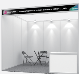
Shell Scheme (1 booth)